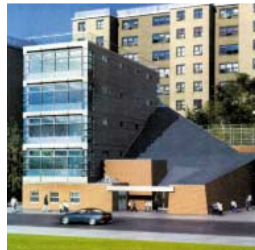
Architectural rendering of new building. Brezavar & Brezavar, Architects